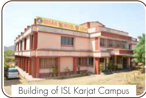
Building of ISL Karjat Campus