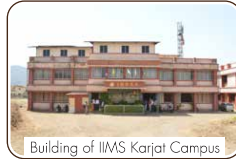
Building of IIMS Karjat Campus