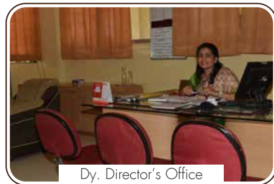
Dy. Director's Office