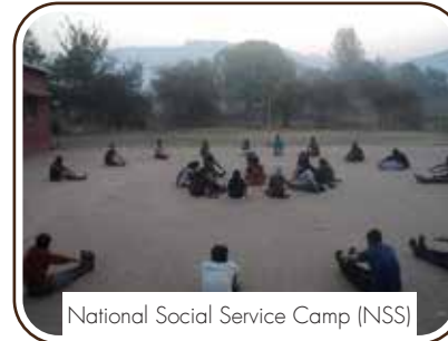
National Social Service Camp (NSS)